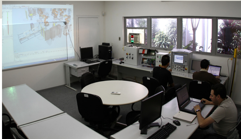
Kuka Brazil engineers use Process Simulate in the company's virtual commissioning lab.

"Process Simulate Virtual Commissioning also enables a higher level of cycle-time productivity, as the robotics cell interlocks are optimized. This means producing more units with the same equipment or, as the experts in the automotive companies say, 'higher jobs per hour (JPH),' which is a huge benefit for our customers. For instance, robotics hemming processes require maximum interlocks optimization, because the robots are working simultaneously very close to each other.