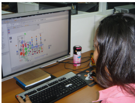
A Kuka Brazil engineer using Plant Simulation to analyze production capacity.

KUKA Brazil has been harnessing the value of solutions in the Tecnomatix® portfolio for years, including Plant Simulation and Robcad™ software, and recently Process Designer and Process Simulate for automotive robotics, body-in-white (BIW) production lines. As the advantages of Process Simulate became more evident, the company began transitioning from Robcad to Process Simulate.