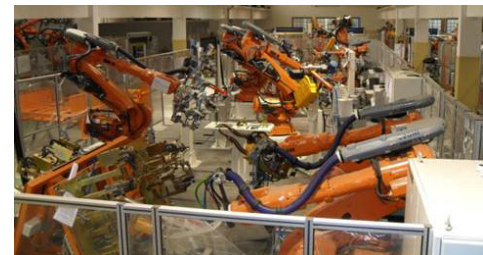
An automotive body-in-white production line tested by KUKA Brazil prior to shipment.

"We were also impressed that we can engage Process Simulate Virtual Commissioning perfectly with non-Siemens controllers – for example, Allen Bradley controllers – using an OPC (OLE for Process Control) server. This highlights Siemens PLM Software's strength as a solutions provider with open tools."